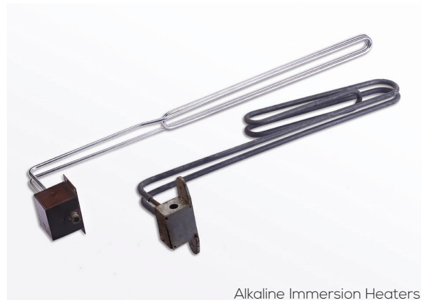
Alkaline Immersion Heaters